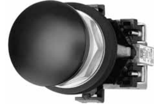
40 mm Mushroom Head Operator Cat. No. HT8AEH