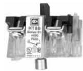
NC Contact Block