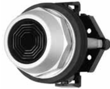
Flush Head Operator Cat. No. HT8AAH