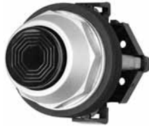
Extended Head Operator Cat. No. HT8ABH